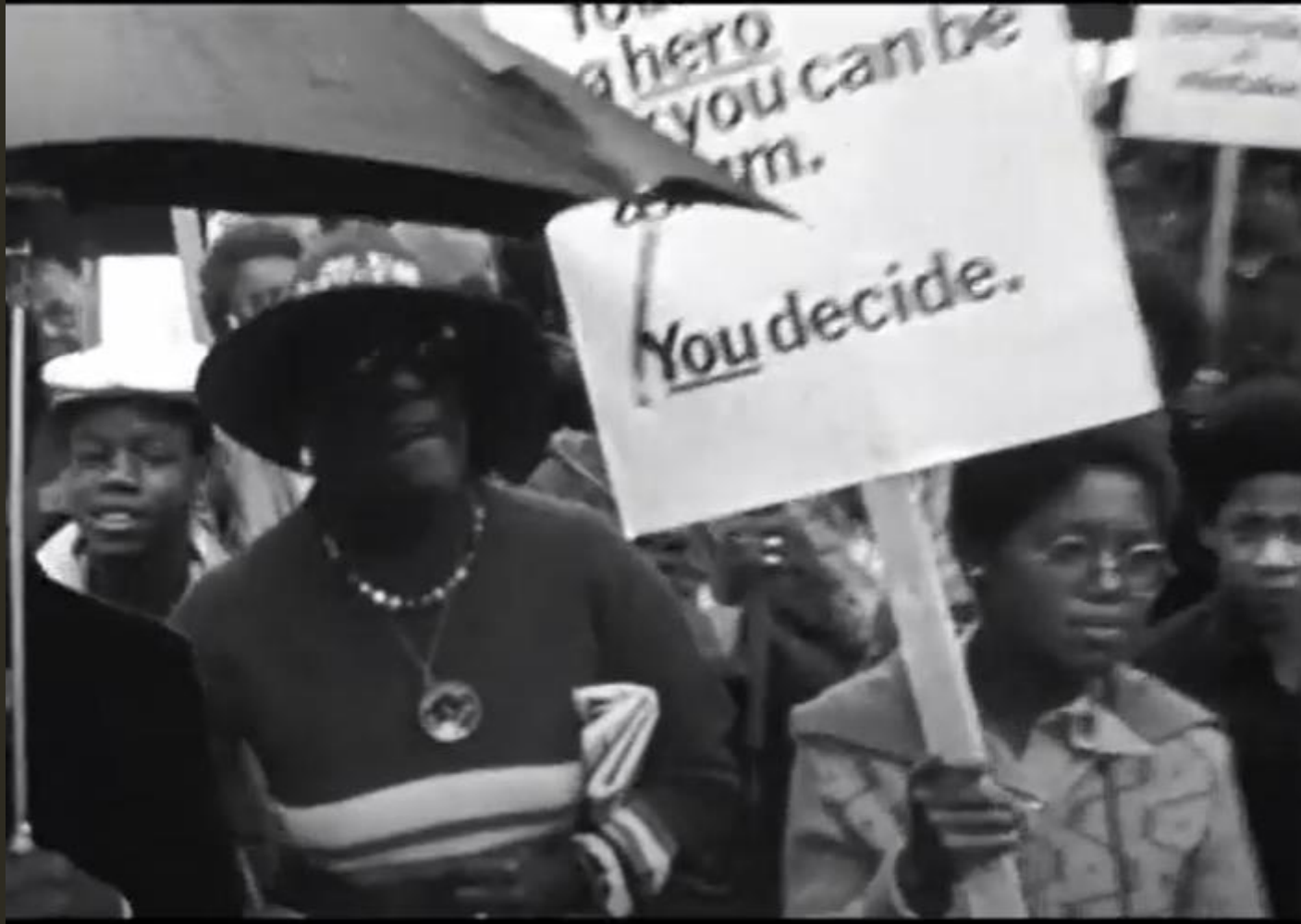
Image from live news footage - October 18, 1975, Trenton, used in 1999 "The Hurricane" movie