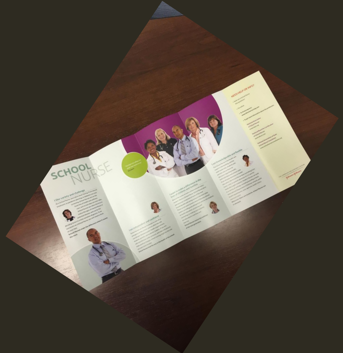
A Day in the Life - Sheila (School Nurse) - YouTube