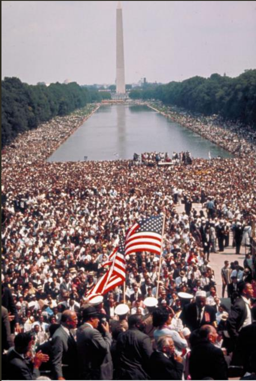
Scene from the March on Washington for Jobs and Freedom, August 28, 1963.