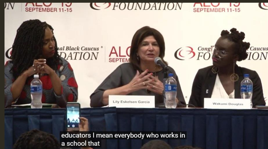
PUSHOUT: The Criminalization of Black Girls in Schools - ALC '19